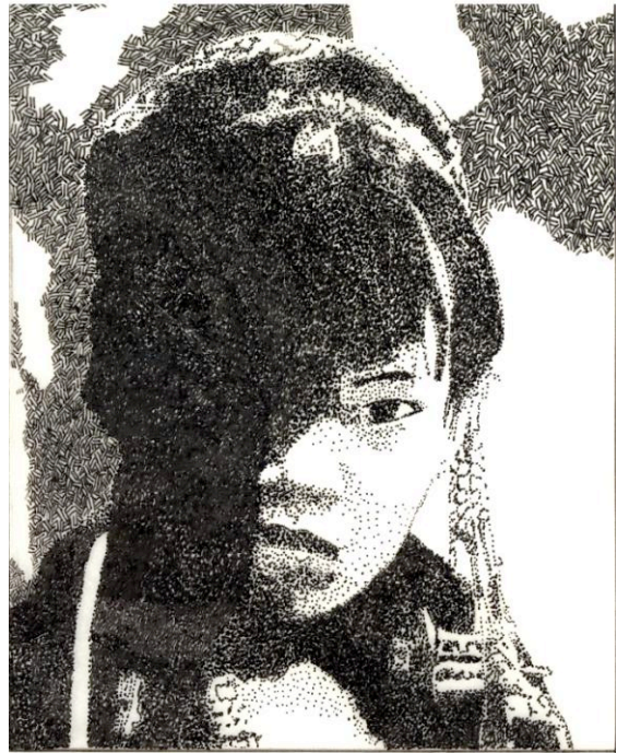
Figure 1 Portrait of a Young Woman

with light as it is with darkness. Dionysian shadows, signifying the primal forces of life and materiality that resist and precede rationalization, veil half of her face, even as much of the portrait seems lit by the Apollonian clarity of her gaze, which seems to hint at a certain kind of detachment that comes with some measure of rational reflection. The portrait reminds me that for Nietzsche, paraphrasing The Birth of Tragedy (2000) the alleged serenity of Greek culture is not some happy prelapsarian state, and so an emblem of an original innocence that has since been irretrievably lost, but rather the end result of an arduous and protracted struggle to come to terms with suffering caused by life, the hard-won triumph of Apollonian form over Dionysian insight, which is the essence of the artistic, and the deeply spiritual, beyond conventional categories of 'good' and 'evil.'