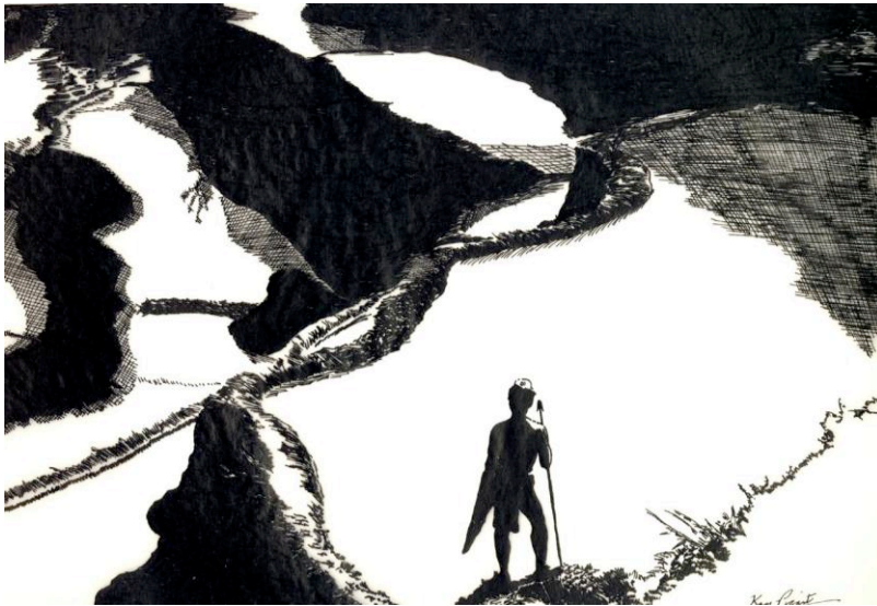
Figure 3 Stairway to the Sky 2

moderate rather than the tropical (or polar) zones, but we see that this is simply one of several possibilities open to exploration.