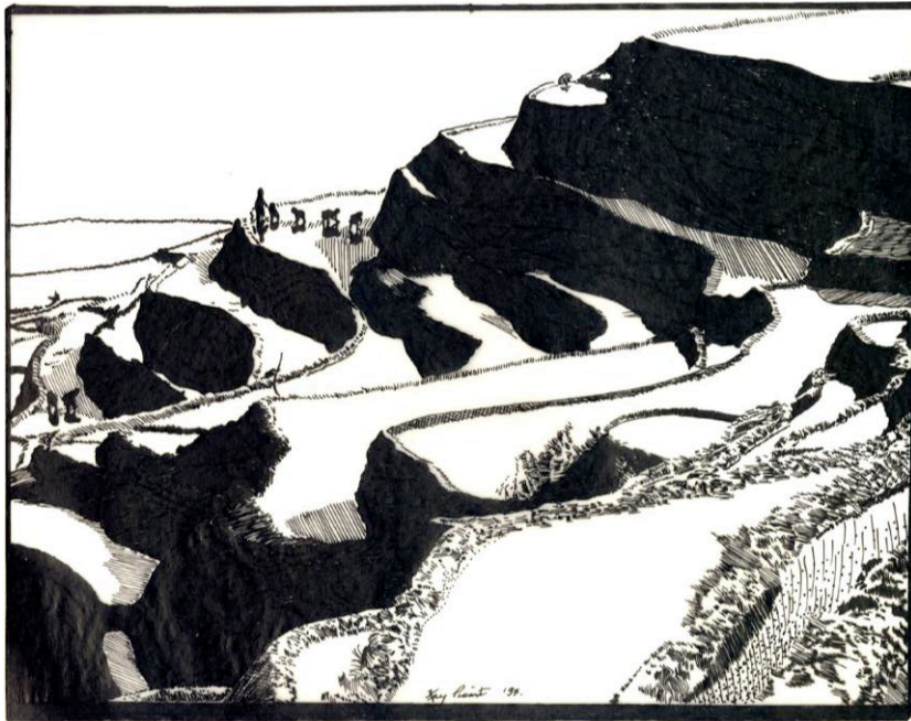
Figure 2 Stairway to the Sky 1

little specks. Done in fine point pen and ink pointillist style, the sketches leave open the possibility, visually, of speaking esoterically (to the “donkey-eared” crowd of touristic consumers) and exoterically (to the “small-eared” “higher spirits” who have learned to read with suspicion). To the former, the images are simply artistic versions of snapshots: mementos of their ‘wild adventure’ into the ‘exotic Third World.’ To the latter, the images may be seen as an act of resistance against the forces of colonialism and modernism: an attempt to return to a nature-oriented lifestyle, which views human beings as part of a larger organic whole.