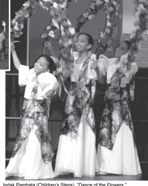
Indak Pambata (Children's Steps), "Dance of the Flowers,"