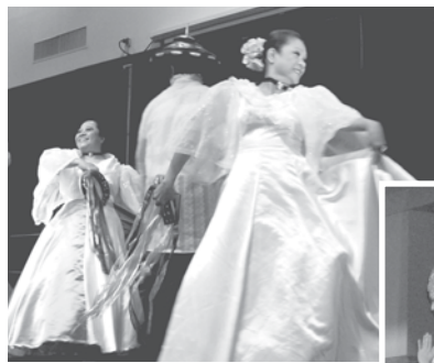
The Philippine Performing Arts Company of Tampa Bay, "Aray," Philippines, Tampa, FL--won third place, Adult Team, Large Group Division