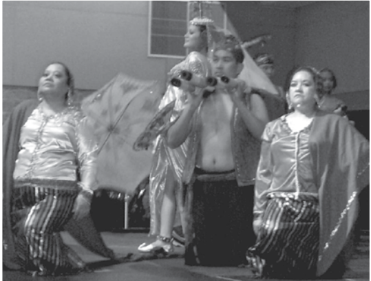
Philippine Performing Arts Company of Tampa Bay, "Singkil," Philippines, Tampa, FL; won first place, Adult Team, Large Group Division

Sanggar Lestari Indonesia, "Pembubung," Indonesia, Atlanta, GA