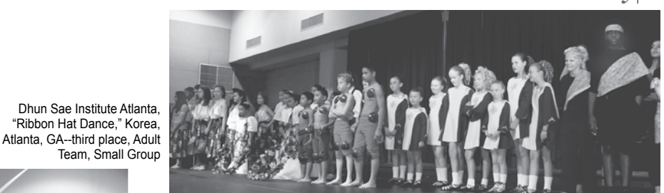
Youth Division Competitors, receiving certificates of participation: from the far left" Valdosta Middle School (Hawaii); Indak Pambata (Philippines--"The Flower Dance"); Indak Pambata (Philippines--"The Coconut Dance"); Glas Tara Jr. Dance Troupe (Ireland)