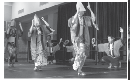
Matsuri-Ren, "Awa Dance," Japan, Valdosta, GA

Sanggar Lestari Indonesia, "Pembubung," Indonesia, Atlanta, GA